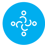
Include all adolescents