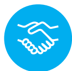
Reach out to adolescents